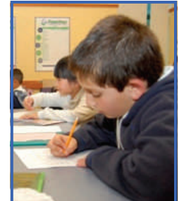
Power Hour Mon-Fri 3:30 pm