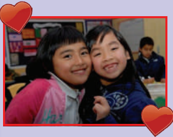
Come celebrate Valentine's Day with us on Friday, February 12th at 4:30pm