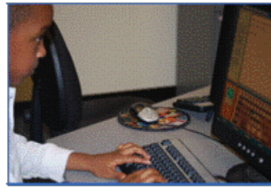
Mavis Beacon Mon-Fri 4:30 pm