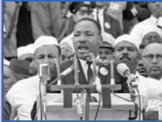
In February, the Mid-Peninsula Boys & Girls Club Celebrates Black History Month